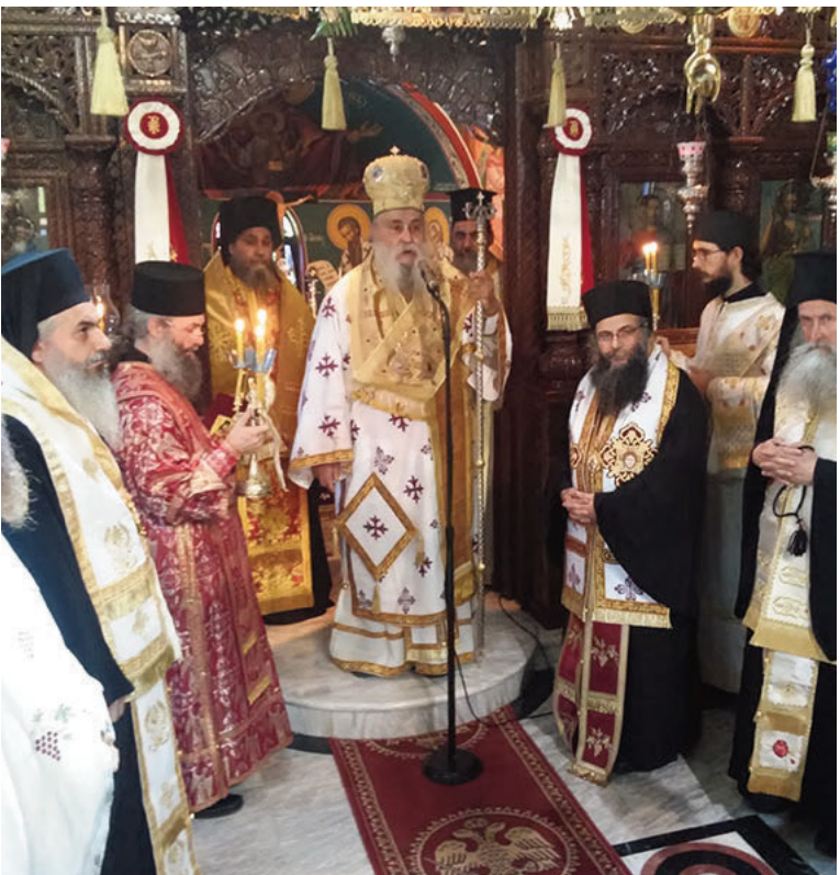
At left, St. Joseph; at right, the Clergy.